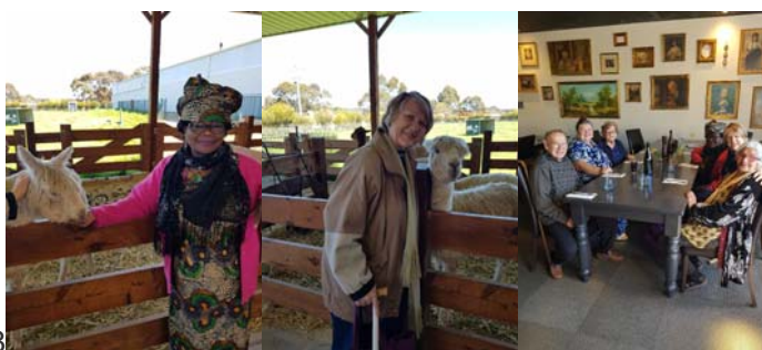
Mini Bus Trip September 2018

We held the first of these trips on 26th September with 6 eligible Seniors. The itinerary involved a tour of the Creswick Woollen Mills with morning tea on arrival, and a fashion parade, followed by lunch at the Creswick Farmers Arms.