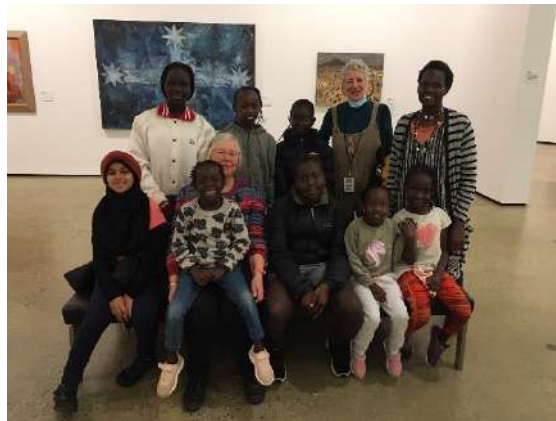
DHC Creative Field Trip to the Art Gallery of Ballarat.