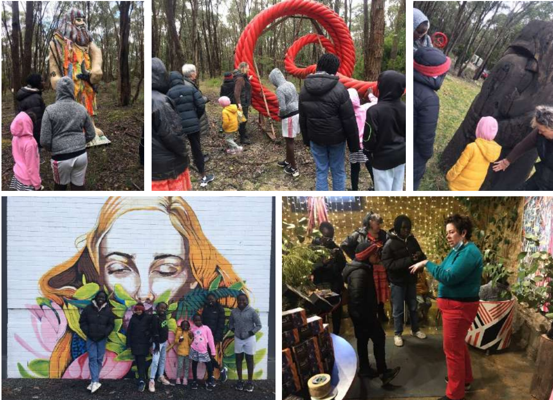
DHC Creative Field Trip to the DJ Projects sculpture fabrication studio, Buninyong Public Art Murals and Salt Bush Kitchen Indigenous food producers.